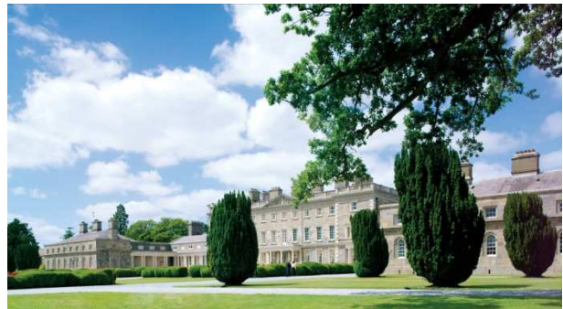
> Carton House Hotel

>Where fire engineering is not required a code compliant solution is adopted. The detail needed can be extensive. Our fire strategy conveys all key requirements and specifications.