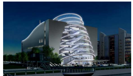
>National Conference Centre