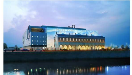
>O2 Venue, Dublin

Other projects Punchestown Racecourse Grandstand, Curragh Racecourse, Citywest Convention Centre, Royal Theatre Castlebar, Druid Theatre Galway, Cineworld Parnell Street Dublin, Liffey Valley Cineplex Swords, Cineplex